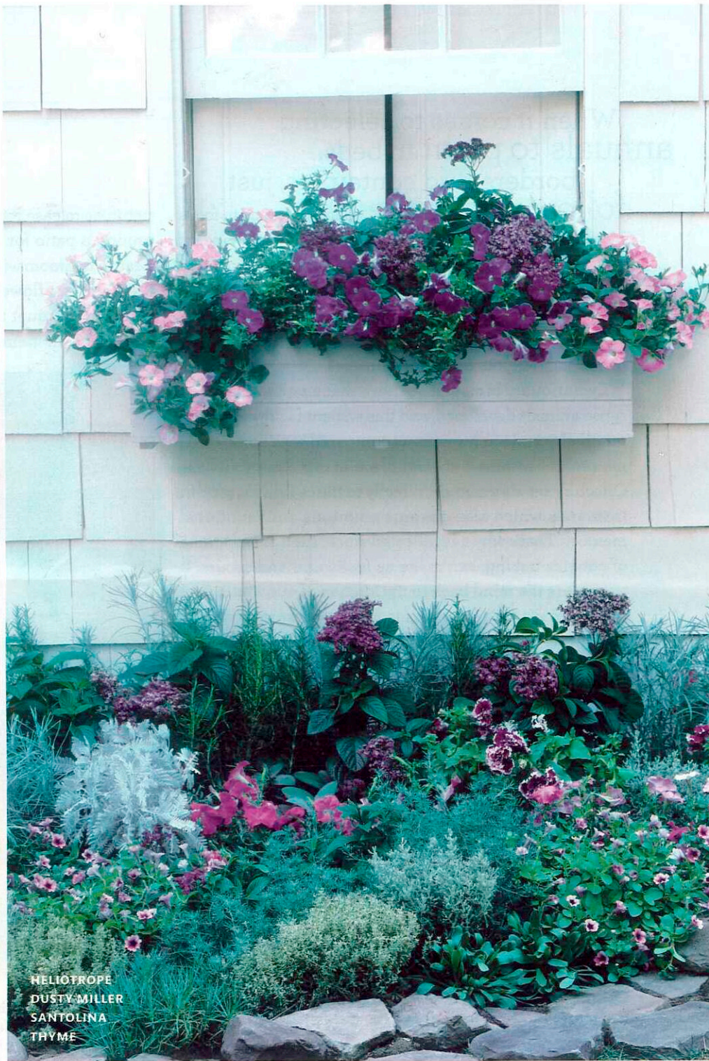
HELIOTROPE DUSTY MILLER SANTOLINA THYME

ABOVE: A window box can bring the outdoors in. Hints of vanilla from these sprightly heliotrope blossoms will waft into the house on a gentle breeze. Pink and purple petunias add color; their trailing habit makes them excellent in containers. Dusty miller (the silvery plant at left), santolina (with feathery leaves, in back), and thyme (in front) are planted in the bed below, so their woody scents will be released as one tends to the window box. TOP LEFT: Moonflower, a fast-growing annual vine, opens lemon-scented flowers after sunset to attract pollinating moths. ABOVE LEFT: Bicolored blossoms and outstanding heat tolerance make 'Cupani's Original' one of the finest fragrant sweet peas.