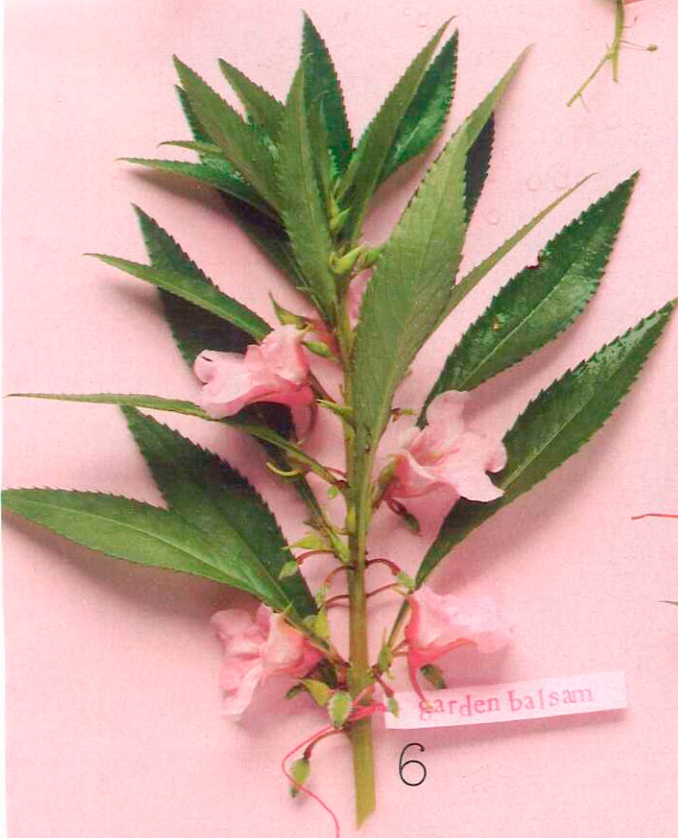
6 garden balsam