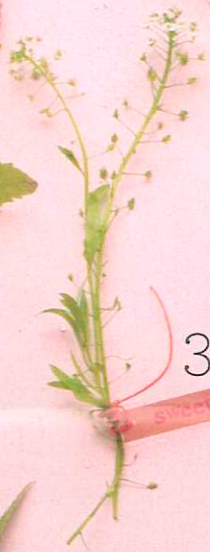
3 sweet alyssum