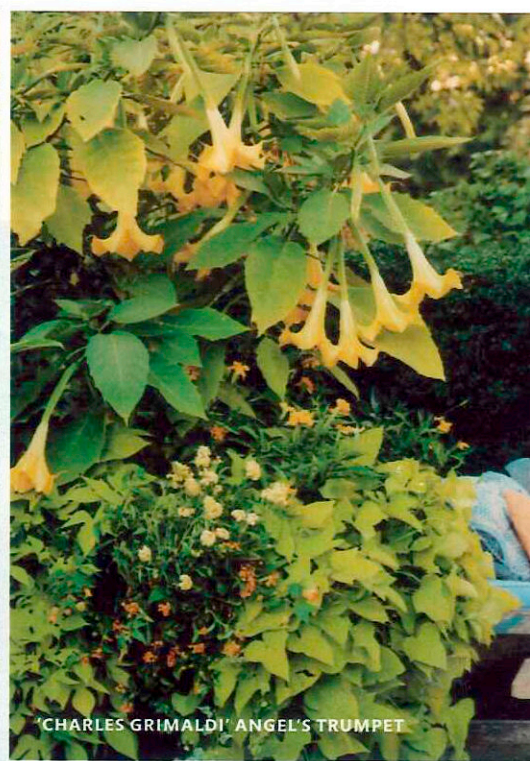
'CHARLES GRIMALDI' ANGEL'S TRUMPET