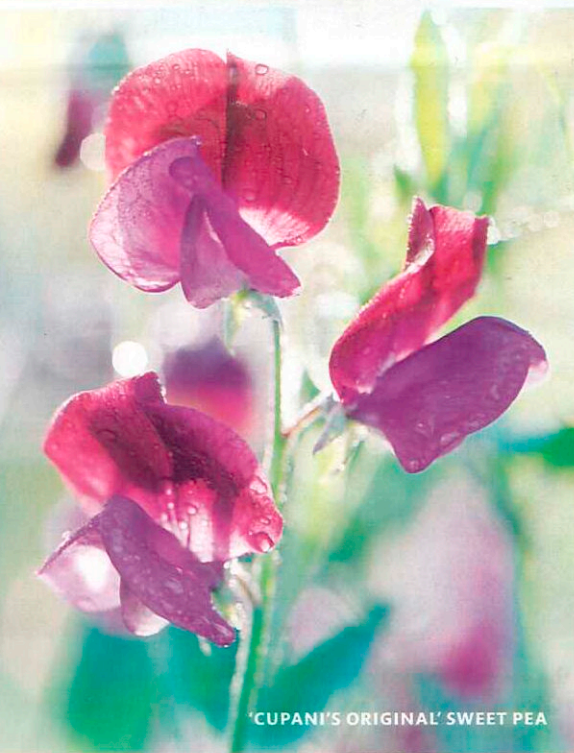
'CUPANI'S ORIGINAL' SWEET PEA