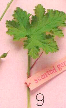
9 scented geranium