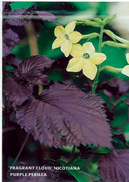
'FRAGRANT CLOUD' NICOTIANA PURPLE PERILLA

ABOVE: This basket hangs like a chandelier over an alfresco dining table, with colorful blossoms rather than crystals. Its sweet-scented 'Priscilla' and 'Royal Velvet' petunias, intertwined with Helichrysum petiolare 'Lemon Licorice,' bloom from late spring to frost, delighting butterflies and hummingbirds as well as diners. TOP RIGHT: The foot-long, golden trumpets of Brugmansia 'Charles Grimaldi' exhale their potent perfume at dusk. This fast-growing tropical shrub may reach a height of eight feet in a single summer's growth. ABOVE RIGHT: Pale Nicotiana 'Fragrant Cloud' blossoms seem to glow against purple-leaved perilla, an herb also known as shiso, brightening a shady spot.