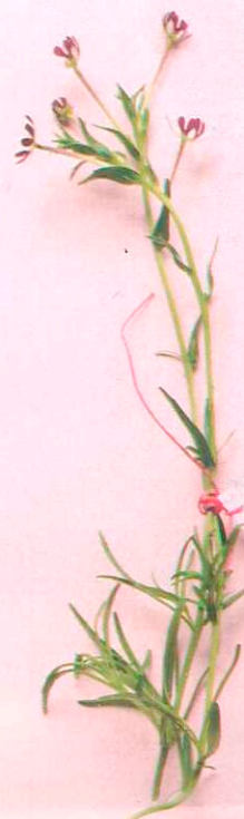
1 night phlox