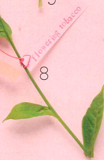
8 flowering tobacco